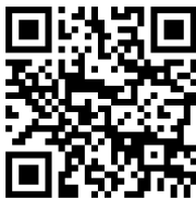
Council #6413 Website

Scan with your smart phone to visit OLMC